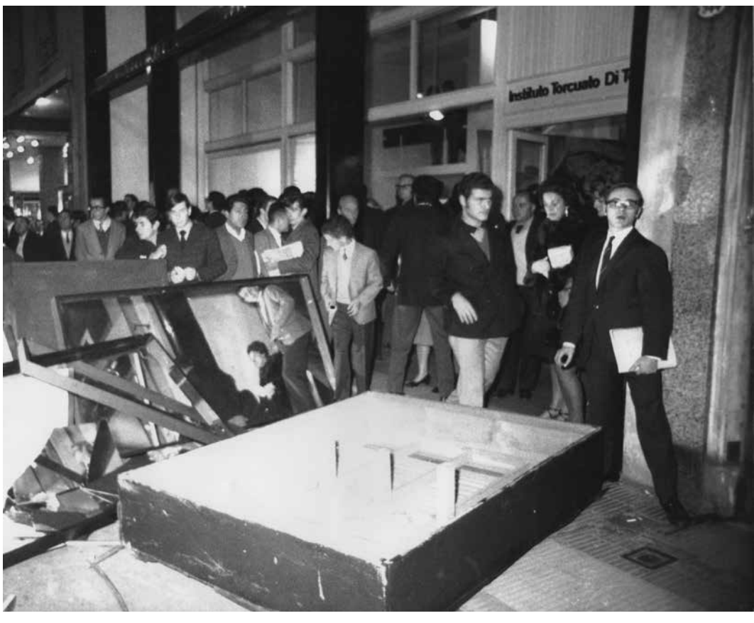
View of Florida Street with artworks destroyed by the artists, end of Experiencias 68 , Instituto Di Tella, Buenos Aires, 1968

Juan Carlos Onganía. As (in)offensive as any graffiti in any public toilet, the inscriptions were found to "disturb the peace" because of the symbolic status of the space in which they appeared. Somebody alerted the authorities, and the police decided to shut down Plate's installation. In the course of that day, visitors saw a transformed (and deformed) artwork: A policeman, now part of the work, preventing access to it. The following day, the remaining artists decided to withdraw from the exhibition