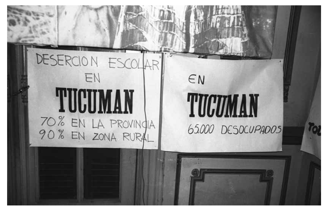
Tucumán Burns, poster, Confederación General del Trabajo de los Argentinos (CGT-A), Rosario, 1968

To fully understand Tucumán Burns , it is not enough to consider its exhibition devices, which I will elaborate shortly. Researchers and curators now tend to confuse the different installments of the exhibition with the whole event, but they were just one phase—and not even the final one—in a sequence whose fundamental goal was to produce a massive work of counter-information.