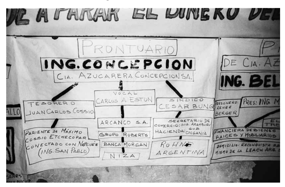
Tucumán Burns, poster, Confederación General del Trabajo de los Argentinos (CGT-A), Rosario, 1968

A comprehensive report titled Tucumán Arde . . . . ¿por qué? (Tucumán Burns . . . Why?), written by a group of sociologists, was distributed to the public. Letters were also exhibited, in which, for instance, a mother wrote to a teacher explaining that her child was dropping out of school because he had no shoes to wear. Testimonies from trade union leaders, workers, and inhabitants were audible through loudspeakers; interviews that had been transcribed and mimeographed were handed out to the public; slides and documentaries about particular issues related to the Tucumán crisis were projected on the walls. Some of these—lost today—had been produced by the team with data collected during their second visit. Others, such as Fernando Solanas