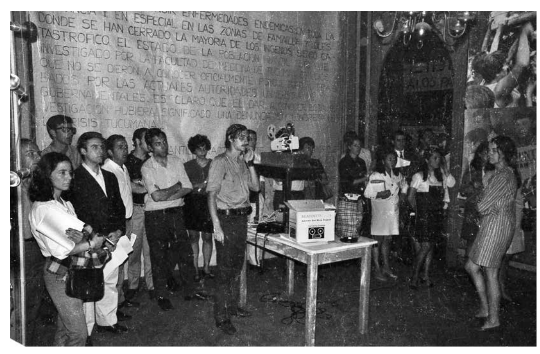
Tucumán Burns, opening of the exhibition at Confederación General del Trabajo de los Argentinos (CGT-A), Rosario. 1968

room). Stairs and doors were also used. By means of blown-up photos, the interior of a humble shack was re-created in an elevator. Two other versions of the exhibition, one in Santa Fe and another in Córdoba, had been scheduled, but all of that was thwarted when the Buenos Aires exhibition was shut down only a few hours after it opened due to direct pressure from the dictatorship.