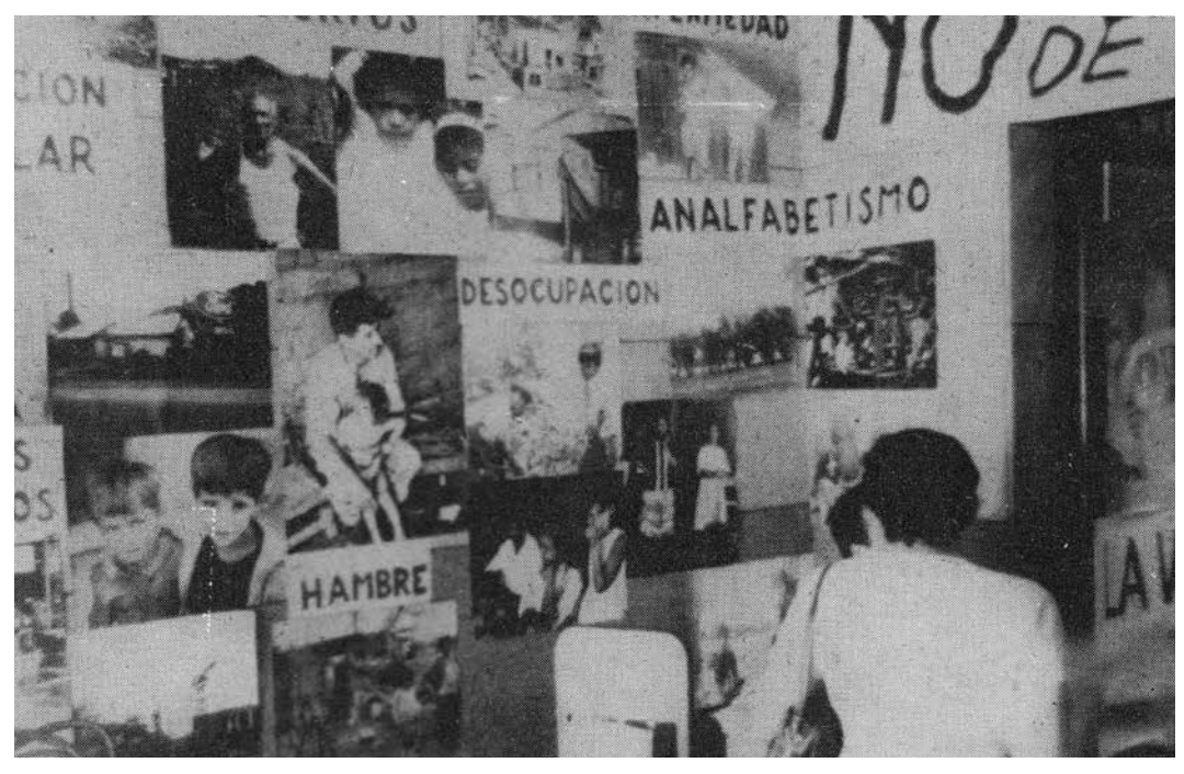
Tucumán Burns, view of the exhibition in Buenos Aires, 1968

In spite of its radicalism, Tucumán Burns was soon afterward affiliated with, and read in relation to, art-world terms and categories, Conceptual art in particular.<sup>17</sup> This attempted taming of its unruly nature was, of course, immediately resisted by