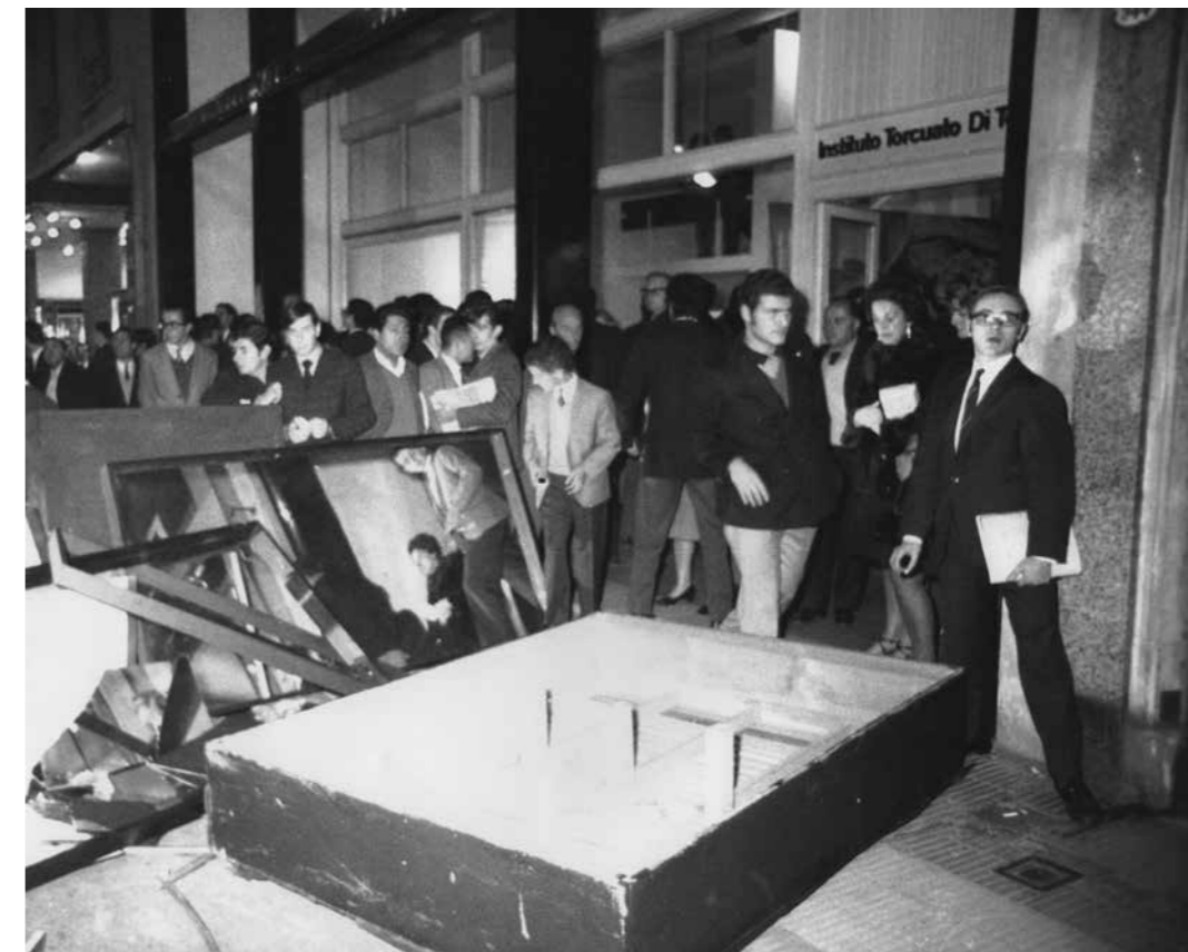
View of Florida Street with artworks destroyed by the artists, end of Experiencias 68 , Instituto Di Tella, Buenos Aires, 1968

Juan Carlos Onganía. As (in)offensive as any graffiti in any public toilet, the inscriptions were found to “disturb the peace” because of the symbolic status of the space in which they appeared. Somebody alerted the authorities, and the police decided to shut down Plate’s installation. In the course of that day, visitors saw a transformed (and deformed) artwork: A policeman, now part of the work, preventing access to it. The following day, the remaining artists decided to withdraw from the exhibition