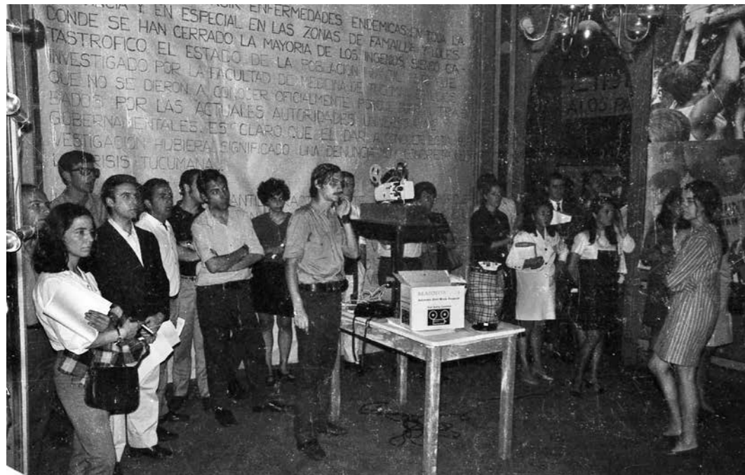
Tucumán Burns , opening of the exhibition at Confederación General del Trabajo de los Argentinos (CGT-A), Rosario, 1968

room). Stairs and doors were also used. By means of blown-up photos, the interior of a humble shack was re-created in an elevator. Two other versions of the exhibition, one in Santa Fe and another in Córdoba, had been scheduled, but all of that was thwarted when the Buenos Aires exhibition was shut down only a few hours after it opened due to direct pressure from the dictatorship.