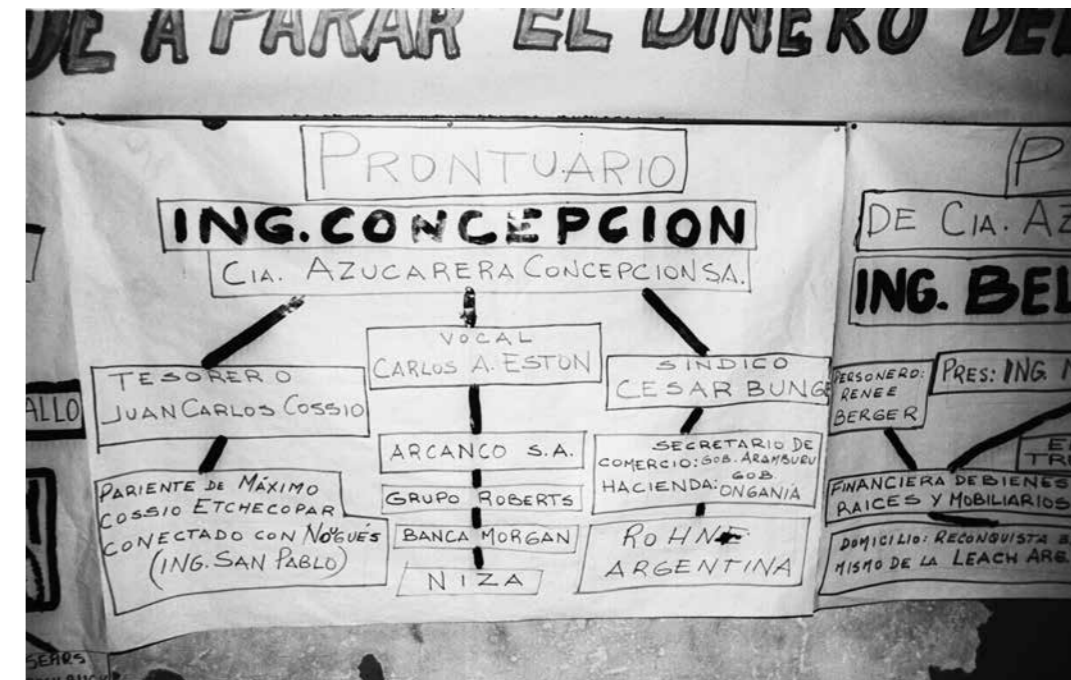
Tucumán Burns , poster, Confederación General del Trabajo de los Argentinos (CGT-A), Rosario, 1968

A comprehensive report titled Tucumán Arde . . . ¿por qué? ( Tucumán Burns . . . Why? ), written by a group of sociologists, was distributed to the public. Letters were also exhibited, in which, for instance, a mother wrote to a teacher explaining that her child was dropping out of school because he had no shoes to wear. Testimonies from trade union leaders, workers, and inhabitants were audible through loudspeakers; interviews that had been transcribed and mimeographed were handed out to the public; slides and documentaries about particular issues related to the Tucumán crisis were projected on the walls. Some of these—lost today—had been produced by the team with data collected during their second visit. Others, such as Fernando Solanas