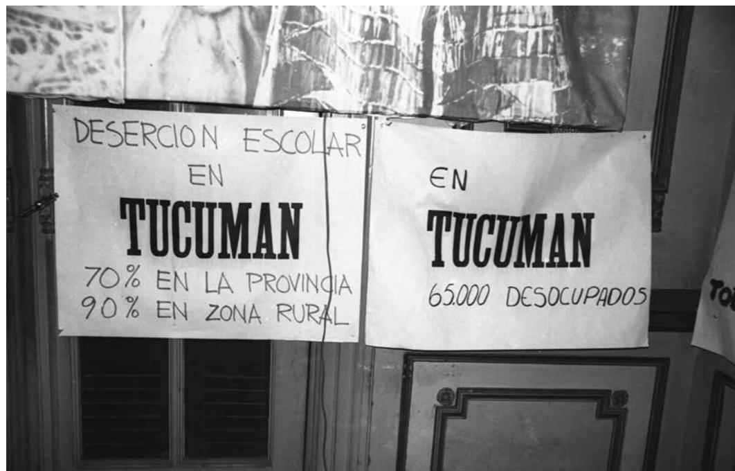
Tucumán Burns , poster, Confederación General del Trabajo de los Argentinos (CGT-A), Rosario, 1968

To fully understand Tucumán Burns , it is not enough to consider its exhibition devices, which I will elaborate shortly. Researchers and curators now tend to confuse the different installments of the exhibition with the whole event, but they were just one phase—and not even the final one—in a sequence whose fundamental goal was to produce a massive work of counter-information.