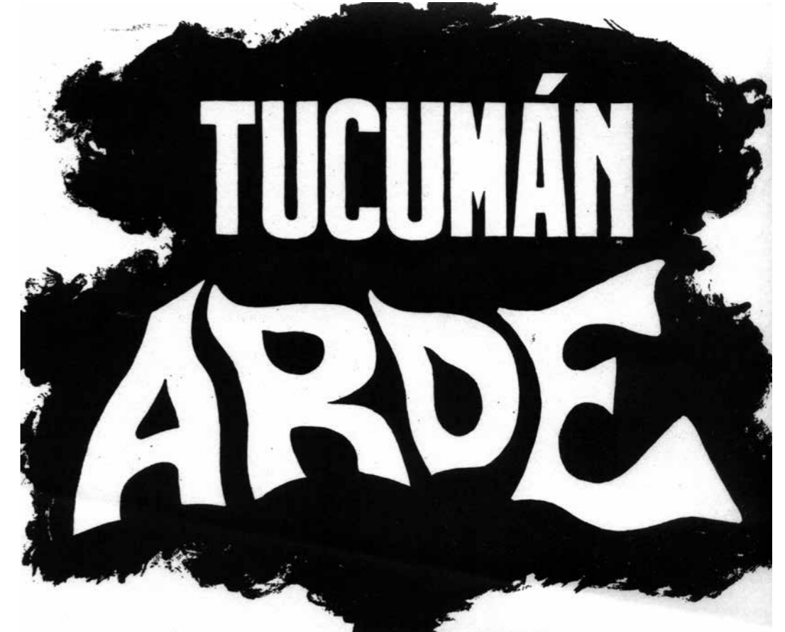
Tucumán Burns , publicity campaign sticker, Rosario, 1968

information about the causes and consequences of the crisis. Putting themselves at some risk, they traveled twice to Tucumán, once in mid-September and again at the end of October, to interview and question a number of people, take photographs, film, and otherwise record all that was happening but that the mass media had ignored or even denied. During their second trip, the artists called a press conference upon arriving in Tucumán and then again before departing.