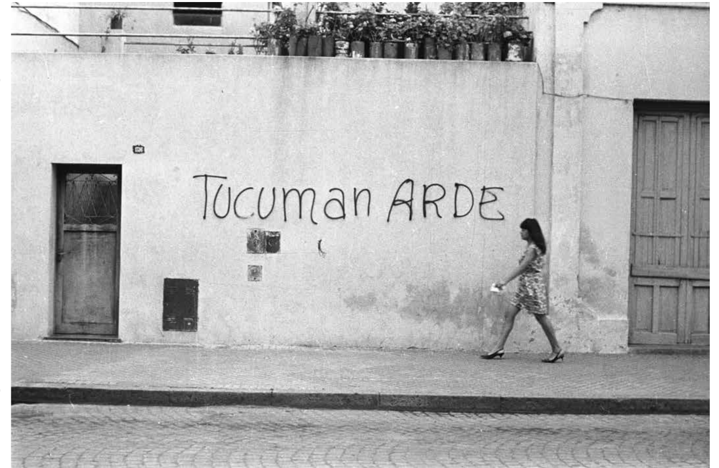
Tucumán Burns, second part of the publicity campaign, Rosario, 1968