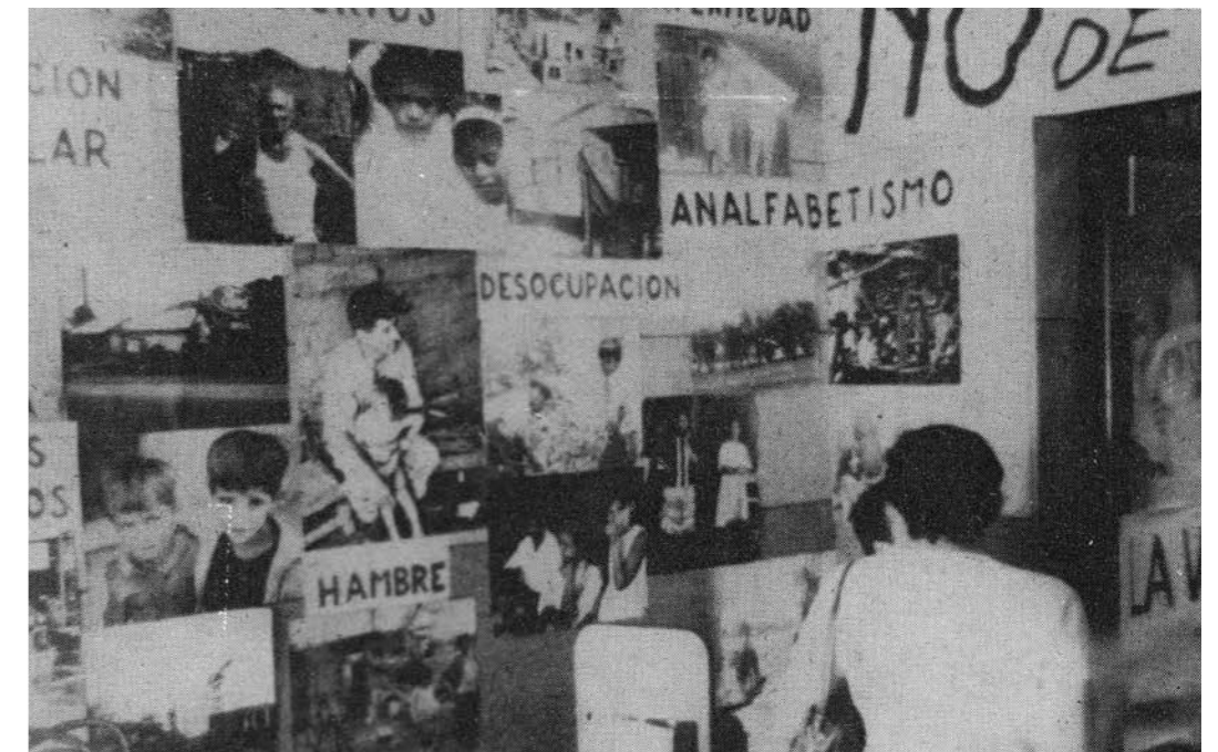
Tucumán Burns , view of the exhibition in Buenos Aires, 1968

In spite of its radicalism, Tucumán Burns was soon afterward affiliated with, and read in relation to, art-world terms and categories, Conceptual art in particular. 17 This attempted taming of its unruly nature was, of course, immediately resisted by