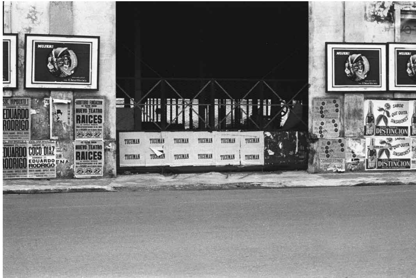
Tucumán Burns, first part of the publicity campaign, Rosario, 1968