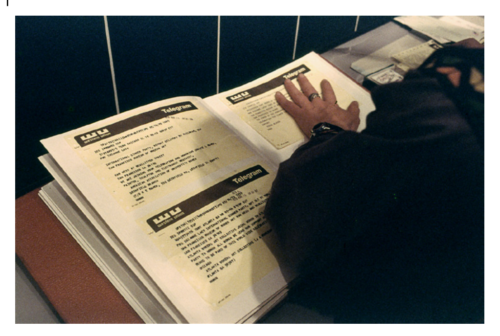
Figure 25.2 Documentation of Suzanne Lacy and Linda Preuss, International Dinner Party , 1979, at San Francisco Museum of Modern Art.

also situates the International Dinner Party in relation to Lacy's art practice, which often incorporated collaborations that were less conceptual than practical, supporting large-scale durational projects or media events, and that intersected activism with performance. Yet while a project like Three Weeks in May included performances by numerous artists, along with workshops and press junkets, in an attempt to expand art into a frame in which a particular issue – in that case rape and sexual violence – could become more visible, the International Dinner Party engaged other women in the realisation of an artwork. As well as the map, the telegrams were incorporated into the work, in folders installed below the map for visitors to flick through. These records were added to over the subsequent weeks as participants sent documents in the form of letters and photographs of their dinner parties.