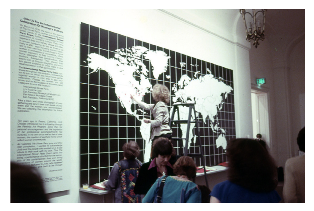
Figure 25.1 Documentation of Suzanne Lacy and Linda Pruess, International Dinner Party , 1979, at San Francisco Museum of Modern Art.

On 14 March 1979, Lacy occupied a gallery at SFMoMA with a large world map, folders and a set of pins. Through the day and night, as telegrams and postcards were received notifying of dinner parties happening internationally, Lacy pinned a red, triangular marker to the map. As time went on the markers multiplied, visually relating the international spread of the work's participants (Figure 25.1 and Figure 25.2). <sup>14</sup> This action mirrored an earlier work by Lacy titled Rape Map , which was included in the performance-event Three Weeks in May (1977). For this work Lacy stamped and stencilled a map of Los Angeles every day, marking where incidents of rape and sexual violence had taken place the night before. Although the two maps have different affective registers – the earlier shocking, the later celebratory – both made invisible women, and hidden acts, visible. This comparison