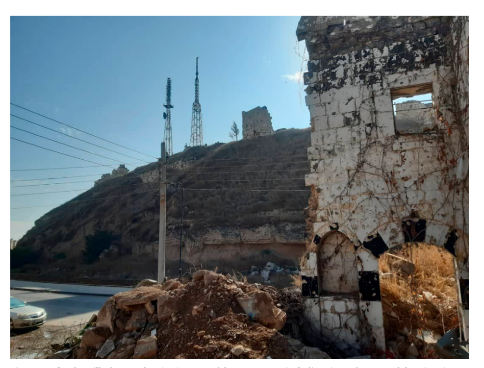
Figure 11.4b The Hill of Homs showing impacts of the recent war, including signs of structural deterioration on the neglected citadel.

The controversy surrounding the historical significance of Homs stems from data collected from aerial photography and geographical scans, along with comparisons of