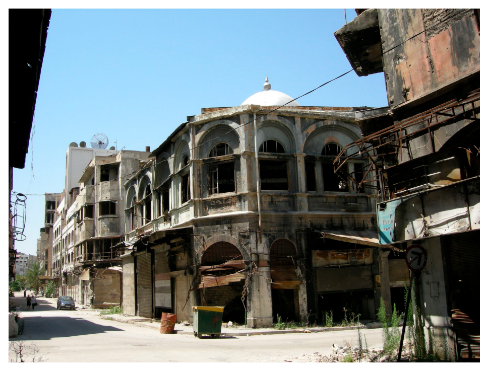
Figure 11.10c Another section of Souk al-Naourah, showing the French-style buildings that used to serve as offices and shops before being destroyed by the recent war. Image: Marwa al-Sabouni