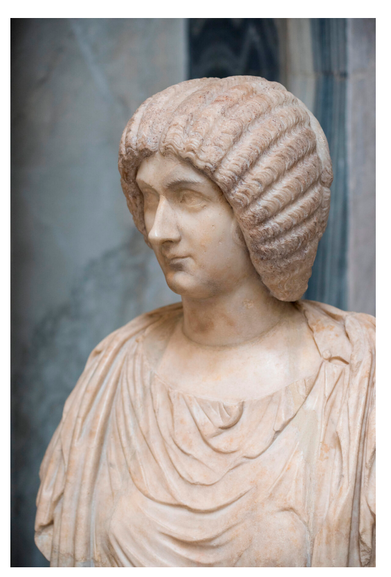
Figure 11.5 Julia Domna, the famous ancient queen born in Emesa (present-day Homs) and wife of Roman emperor Septimius Severus, who ruled from Rome in the third century CE.

However, it is agreed that while the city's ancient name of Emesa is pre-Roman, it continued to be used when Homs became a religious center in the first century. The solar deity Elagabalus (in Arabic, al-Gabal, the Mountain) was worshipped there in a great temple of the sun; the ancient city's coinage displayed an image of the temple with a holy basalt stone at the center. It was built by the ruling Sampsigeramids (or Emesene dynasty), an Arab family of priests who ruled after the Seleucid Empire. They made marital relationships with the Romans and ruled the city as a client kingdom.