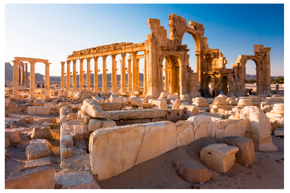
Figure 11.2 Remains of the Great Colonnade at Palmyra. The ruins of ancient Palmyra were one of the prime tourist destinations in Syria before the war and provided a source of employment for those who lived in the area.

Perhaps it is easier to understand the loss of meaning in a place so detached in space and time as Palmyra than it is for places that are part of our daily lives and the actions of our people. The majority of Homs's heritage falls into the second category. The loss of