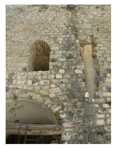
Figures 11.6b–c The war inflicted great structural damages to the mosque, revealing older pillars from a previous structure buried within its walls. These remnants might be seen as indicative of a unique preservation approach that opted not to tear down, but rather to build on.