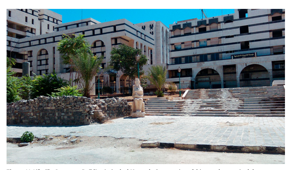
Figure 11.10b The Insurance Building in Souk al-Naourah. Construction of this complex required the demolition of parts of the historic quarter.