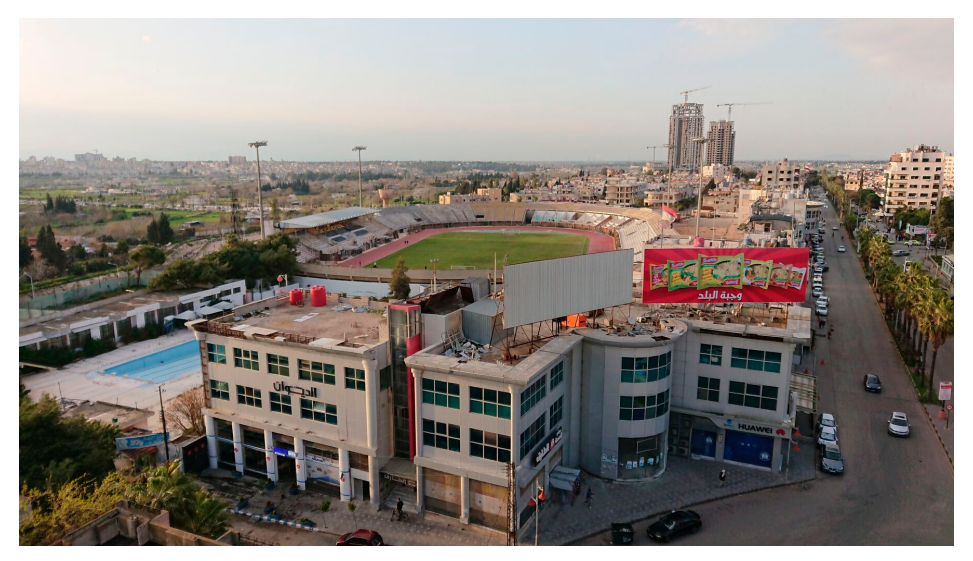
Figure 11.8 The necropolis of Tel Abu Sabun, now the site of the city's main stadium, built in 1960.

dynamited it to make room for an oil depot. The mausoleum, as documented in the drawings and photographs of nineteenth- and twentieth-century orientalists, was a two-story structure, the square base topped with an obelisk whose shape resembled the pyramidical tombs of Palmyra. Each facade was decorated with a row of five columns at the base and another row on the second floor. The building materials—the local black basalt and white limestone mentioned earlier—are a unique feature of Homs's architecture. The greater part of the necropolis had been excavated by 1952 and was reburied to build a municipal stadium (fig. 11.8).