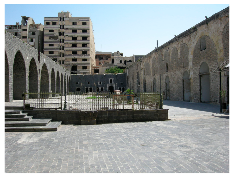
Figure 11.6a The main courtyard of the Al-Nuri Mosque. The structure is built of black basalt, the local building material of Homs.