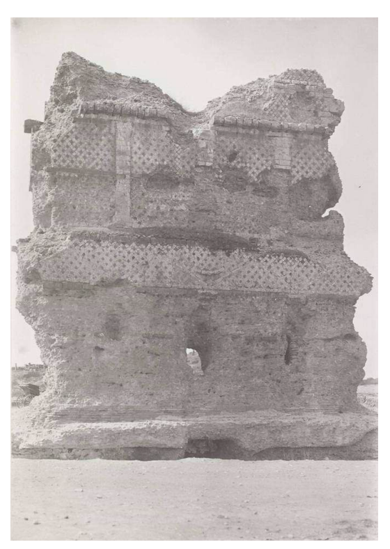
Figure 11.7 The mausoleum of Emesa. Its destruction by the city government in 1911, part of a systematic demolition of the city's identity, resulted in a great loss to the history of Homs.

But Homsis have had little chance to learn about this. "Emesa" and "Julia Domna" were no more than names of local cafés. Today, not much happens in the city. Its economic activity is slow in comparison to that of Damascus and Aleppo, its features are not interesting, and its history is little in evidence. Yet, none of this made sense: the city's location is central, its weather is mild and refreshing, its fields are wide and fertile, and its crops are abundant, as is its history. So why does the city seem to be in constant decline? The answer is multilayered, but the way in which the local government has administered the city's heritage may provide a clue.