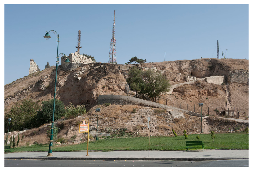
Figure 11.4a The Hill of Homs, where the ancient city was originally built.