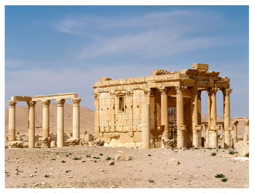
Figure 11.1 The Temple of Baalshamin, one of the most important structures in ancient Palmyra, before its destruction by ISIS in 2015.

But what about the other half of Palmyra, the living half? This was a modest and modern urban settlement, adjacent to the ancient ruins, housing five hundred thousand people before the war. In the recapture of Palmyra, the town was destroyed and almost