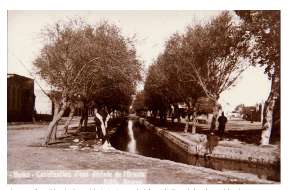
Figure 11.9b An historic photo of the irrigation canal of al-Mujahediya, a beloved part of the picturesque cityscape that was largely covered by roadways as part of so-called modern planning.