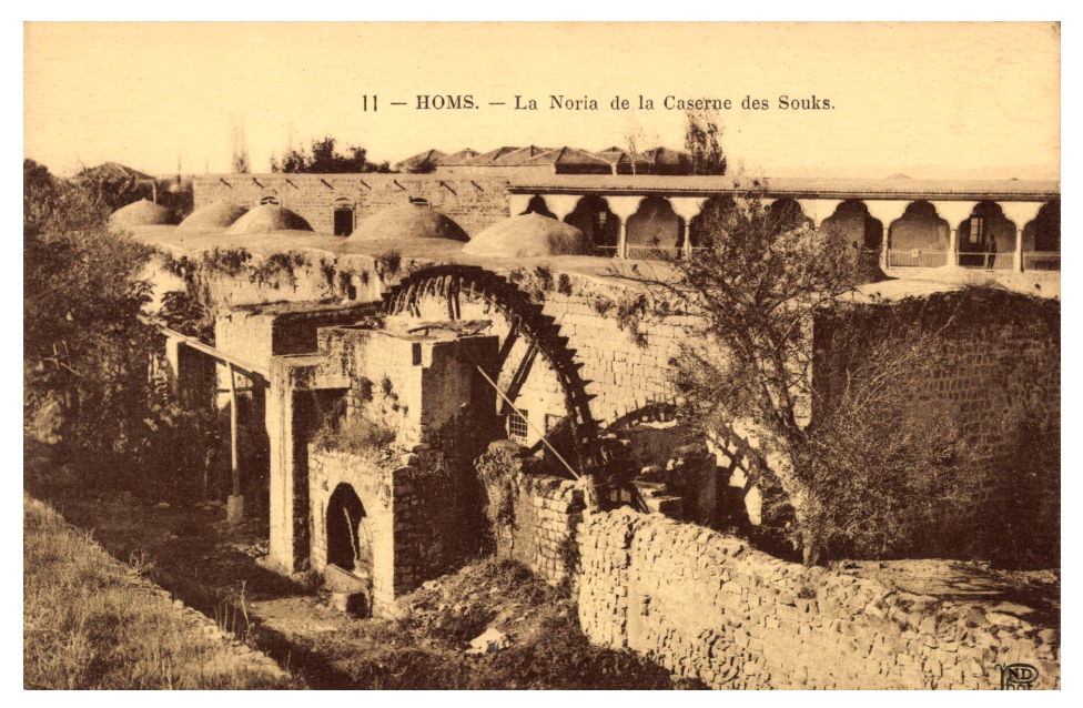
Figure 11.10a An historic photo of the Naourah ( noria ), or waterwheel, after which the city quarter Souk al-Naourah is named. The only remnant of the waterwheel today is the name of the neighborhood.