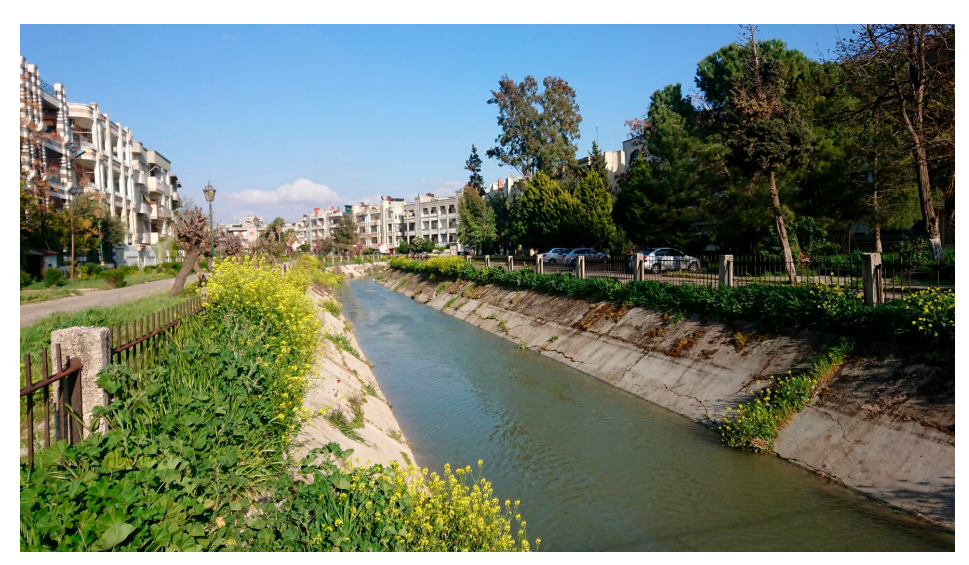
Figure 11.9a A 2021 photo of the irrigation network running through the city. Municipal decisions to let the water flow are followed by others to restrict it, an on-and-off approach not explained to the public.