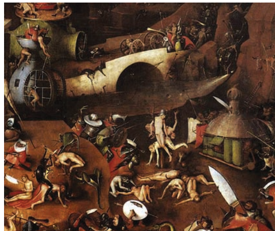
Fig. 1. This detail from The Last Judgment by Hieronymus Bosch illustrates the artist’s apocalyptic vision of some of the worst that humans can think, say, or do.

Observers of human psychology have suggested that the mind can indeed generate just such ironic errors. Edgar Allan Poe called this unfortunate feature of mind the “imp of the perverse” (1). Sigmund Freud dubbed it the “counter will” (2). William James said too that “automatic activity in the nerves often runs most counter to the selective pressure of consciousness” (3). Charles Baudouin pronounced it the “law of reversed effort” (4), and Charles Darwin joined in to proclaim “How unconsciously many habitual actions are performed, indeed not rarely in direct opposition to our conscious will!” (5). Hieronymus Bosch illustrated this human preoccupation with the worst,