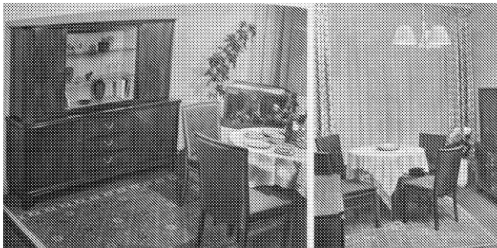
Fig. 2. Inspirations for GDR interior design. (From the Besser Leben—Schöner Wohnen catalog, 78–79.)

Rearguard warnings about the pitfalls of such modern styles were issued by the East Berlin Bauakademie, 37 while Ulbricht himself condemned East German “technoid” domestic modernism (“black coffee cups, black souls,” as he put it once) for being spiritually bankrupt. 38