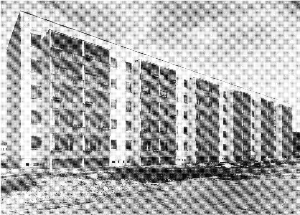
Fig. 3. Prototype of a P2 apartment building. (From the exhibition catalog Tempolinsen und P2: Alltagskultur der DDR [Berlin, 1996], 86.)

ress. 42 No doubt the 1961 construction of the Berlin Wall loomed in the background, to the extent that the 1962 show aimed to stem growing internal criticism about socialism’s backwardness and material misery. It was also during the early 1960s that the SED decided to embark on its daring experiment in “consumer socialism”—complete with state advertising agencies, colorful product packaging, modern furniture, household decoration magazines, mail-order clearinghouses, and even state travel bureaus—as a kind of Great Leap Forward in the modernization of GDR material culture. Passages from Marx and Engels’s German Ideology —in particular the one stating that “Life however involves above all eating and drinking, a dwelling, clothing and other things. The first historical act is thus the production of the means to satisfy these needs”—were repeatedly cited to illustrate the SED’s firm commitment to meeting the consumer needs and desires of its citizens. 43 Yet it was housing that held center stage in this reform initiative, and it was this P2 design that fundamentally remade East German domestic life. In fact, it became the standard model of East German residential building construction from 1962 all the way