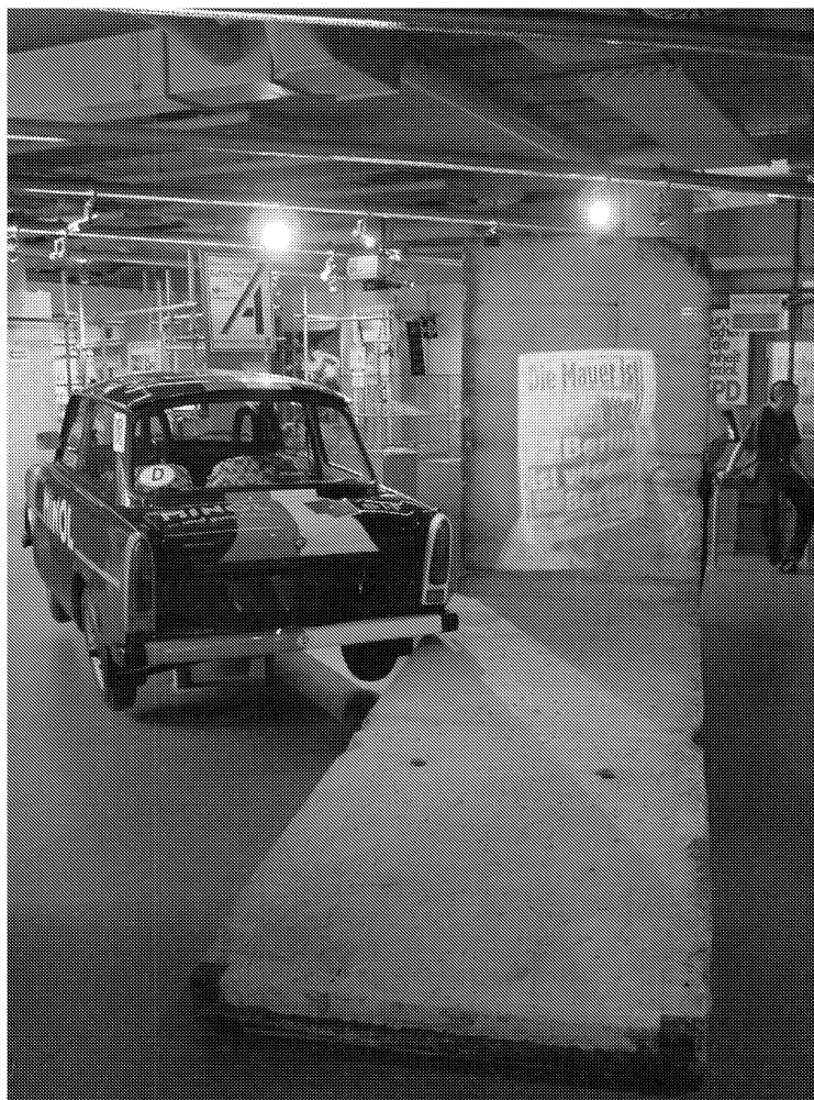
Fig. 4. At the ZGF, a section of Berlin Wall and Trabant painted in Western commercial style with the GDR gas company Minol brand name.