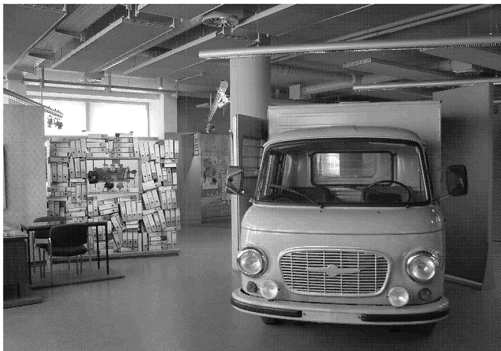
Fig. 3. The Stasi van and files at the ZGF.

example, one is confronted with videos of attempted escapes, with people screaming, hanging out of windows, or being mangled by barbed wire. The reverberations of tank rumblings and screeching provide the audio background for the June 17 uprising. With the exception of dissident songwriter Wolf Biermann's music, in fact, one's auditory experience of the museum is dominated by the sounds of bullets being fired, churches being blown up, and human cries of alarm. Taken together, these acoustic enhancements are carefully selected to conform to the museum's emphasis on repression and resistance, a narrative described by museum directors and employees as "the Concept." 18