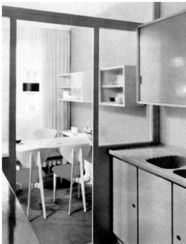
Fig. 4. Kitchen in a model P2 dwelling.

no traces of the interwar fascination with bringing Taylorist factory ethics—much of which was based on the disciplining and rationalization of the female homemaker—into the home. Indeed, housework and domestic labor—let alone its work station, the kitchen—hardly figured in this show at all. Housework, in the forms of communal laundries and kitchens, was to be taken out of the private domicile altogether. By contrast, the 1962 show marked the full-scale introduction of the world of industrial technology and rationalization into the home. 46 The socialization of household services still continued apace, but there was increasing clamor from women's groups for more labor-saving appliances to ease their dou-