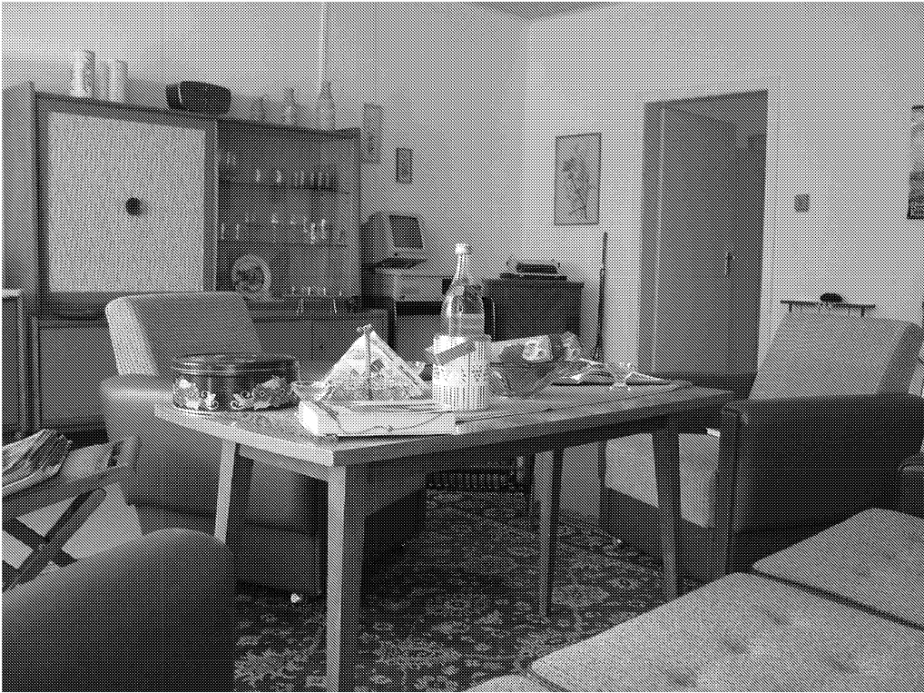
Fig. 5. Reconstructed GDR living room ( Zeitzeugen Ostalgie ).

day upon hearing what schoolchildren were learning about the GDR in class: