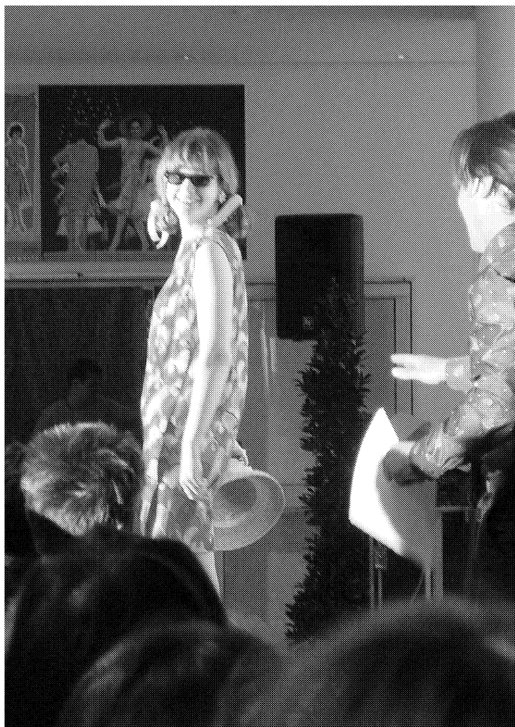
Fig. 8. GDR fashion show at the ZGF in Leipzig, 2001.

“democratization” and national legitimacy in which access to consumer goods and consumer choice is defined as a fundamental right and a democratic expression of individualism. Indeed, many observers have since suggested that the transitions of 1989 were about demands not for political or human rights but for consumer rights. 39 As the historian Ina Merkel has observed: “The struggle between the systems did not take the form of armed conflict, but was rather shifted to the marketplace. And it was here, in the sphere of consumerism, that the battle was won.” 40 In the context of this postwar relationship between political legitimacy and mass consumption, such re-presentations of the GDR not only contribute to the produc-