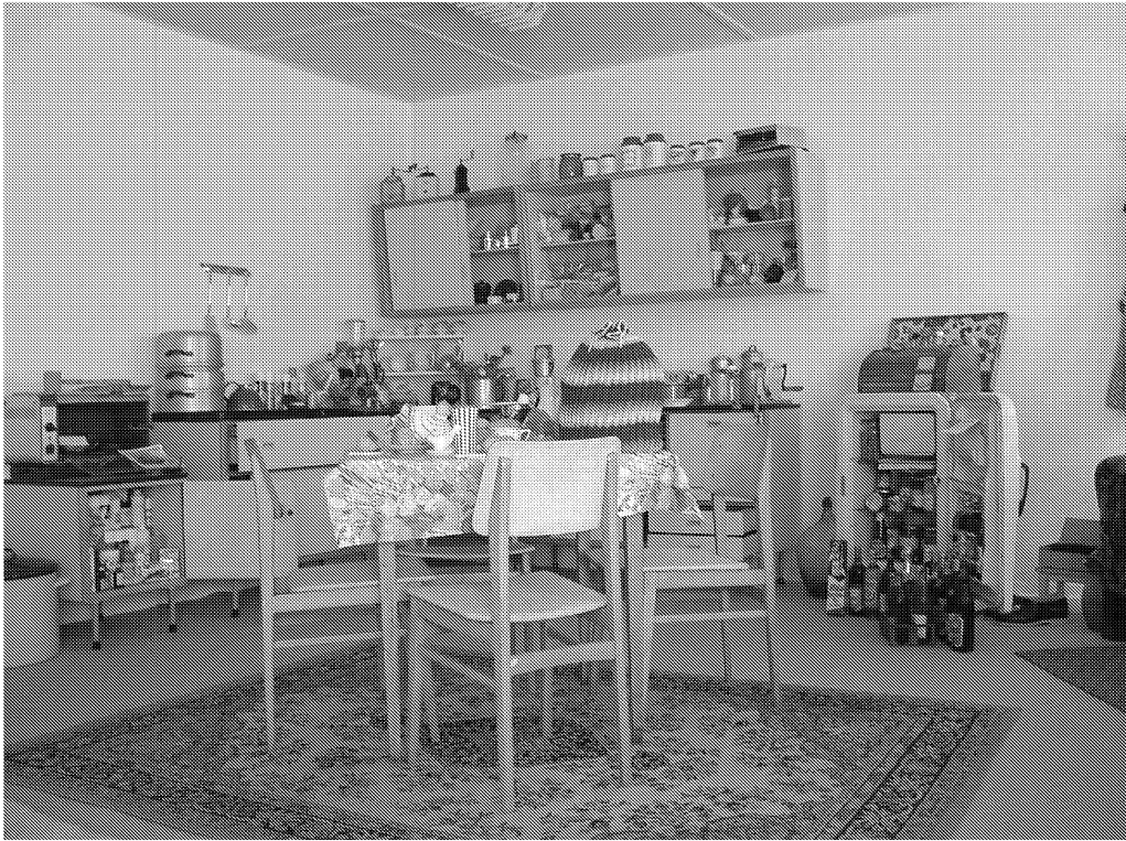
Fig. 6. Reconstructed GDR kitchen (Zeitzeugen Ostalgie).

or Free German Youth (FDJ) scarves. In the kitchen area they described showing schoolchildren how juice was pressed, how fruits and vegetables were preserved, “because you couldn’t just go to the store and buy everything.” The quaintness of socialist design was particularly highlighted in the electronics room, featuring, among other things, a square phonograph record (fig. 7). “We chose the name ‘historical witnesses,’” one of the directors explained when I asked about the project title, “because we didn’t want to write simply ‘objects of utility’ [ Gebrauchsgegenstände ] but also because these [things] really are witnesses.”