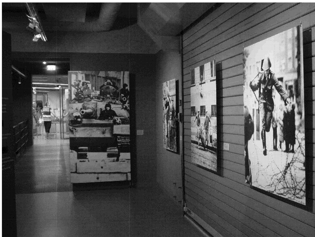
Fig. 2. Images of the Berlin Wall at the ZGF.

Like those of many contemporary museums, the ZGF exhibits draw upon multiple media to invite active visitor participation and engagement. Audio stations, touch screens, video monitors, and interactive hands-on displays abound as part of the Haus der Geschichte's larger objective of enabling visitors to "experience history." A review of the ZGF exhibit after its 1999 opening in the Frankfurter Allgemeine Zeitung , for example, praised its "effectively staged tour route" where "not a corner is without a flickering monitor or a chattering loudspeaker." 15 "We present history as an experience, as visitor-friendly and entertaining," the president of the Bonn Haus der Geschichte, Hermann Schäfer, recently asserted. 16 Indeed, in response to a historian colleague's comment that the Bonn museum reminded him of Disneyland, Schäfer reportedly responded, "Thank you very much. But we're not that good yet." 17