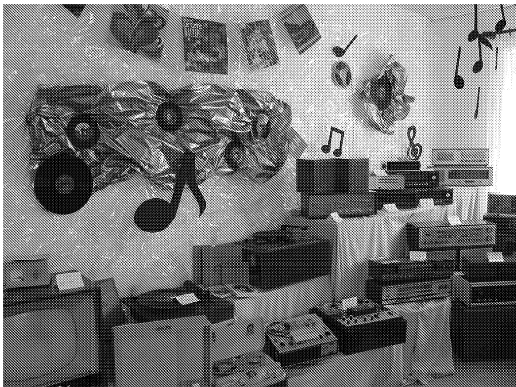
Fig. 7. Colorful display of GDR electronics ( Zeitzeugen Ostalgie ).

Very nice. . . . it recalls memories, above all how the prices remained stable for years.