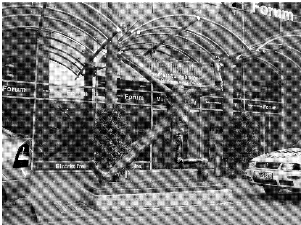
Fig. 1. The Step of the Century , in front of the Leipzig Forum of Contemporary History (ZGF)

new Germany's step out of the last century, leaving behind its troubled pasts of Nazism and socialism.